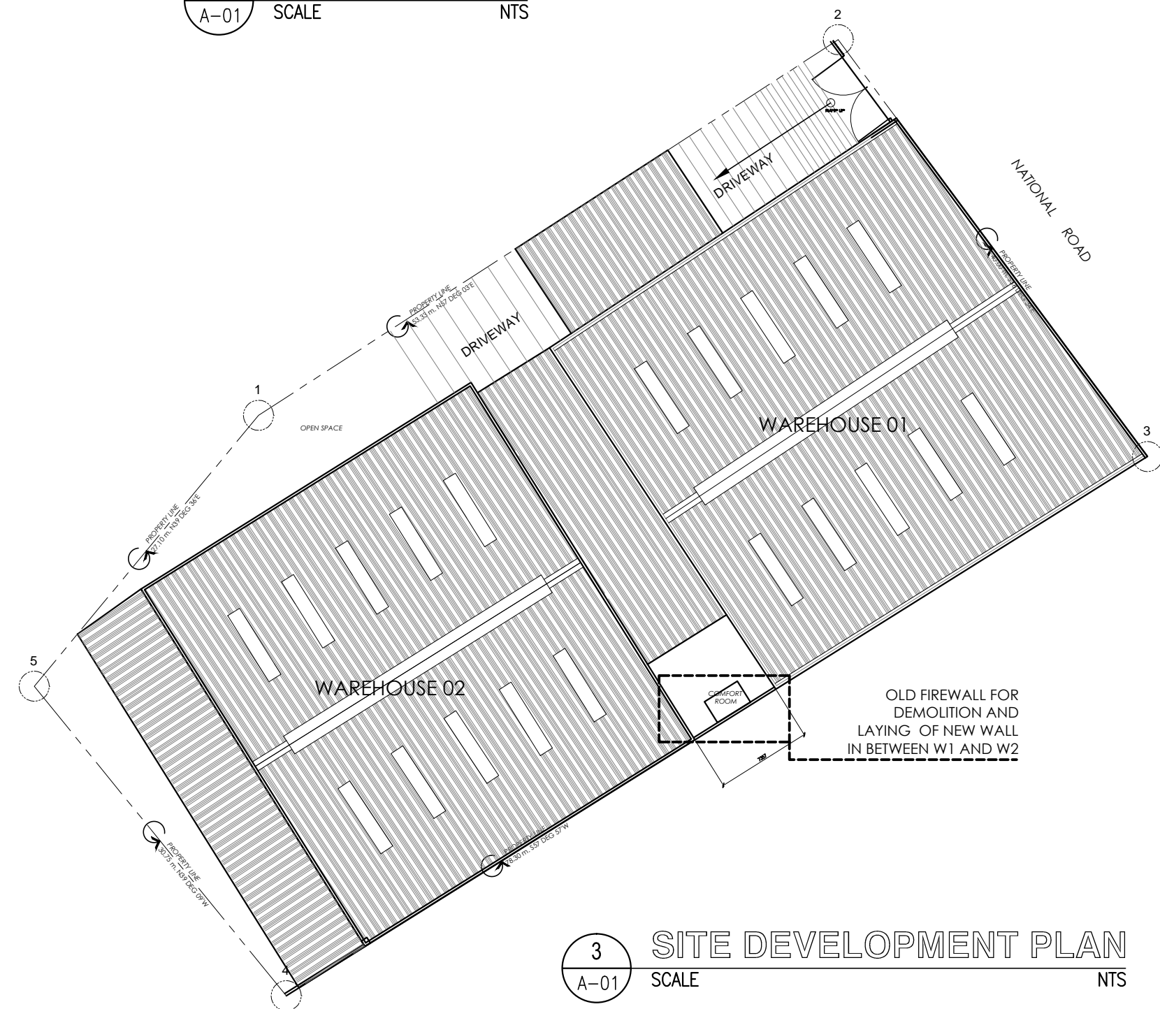
3 SITE DEVELOPMENT PLAN A-01 SCALE NTS