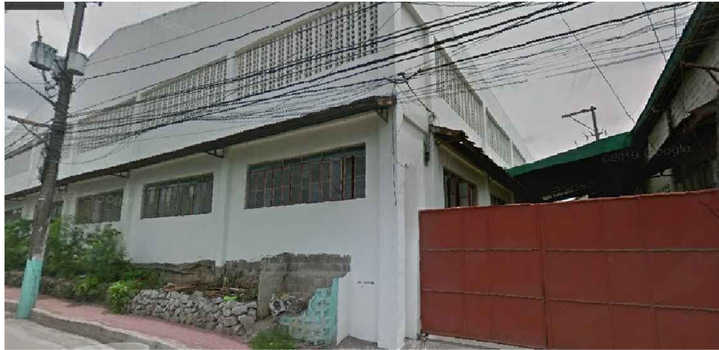
1 PERSPECTIVE A-01 SCALE NTS